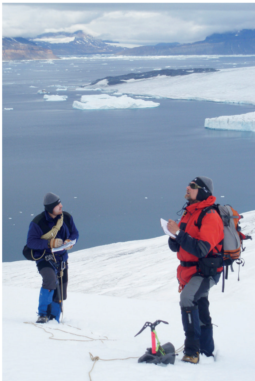
Under Mt. Reece above the Prince Gustav Channel, Antarctic Peninsula