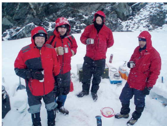
Field kitchen on the edge of the Victory Glacier, Antarctic Peninsula.

It should be remembered that, even in 1989, the Central Geological Institute, the precursor of the CGS, had a worldwide reputation for the quality of its work. Today, we are a reliable partner working with other geological surveys and commanding international respect. This is evident from our membership of EuroGeoSurveys in which we play an active and important role. However, it is true that we still look to wealthier geological surveys in Western Europe and overseas, for guidance in state-of-the-art 3D modelling of geological structures and for expertise in managing large international projects. There is a vast difference between the investments they have made in infrastructure, equipment and operational costs and those that we are able to make. On the other hand, we have the advantage that our field geologists have an excellent practical and theoretical background, which enables them to undertake regional mapping and geological synthesis anywhere in the world. Unlike, for instance, Scandinavian geological surveys or the Polish Geological Institute, the CGS suffers from an ongoing problem of underfunding for research on natural resources.