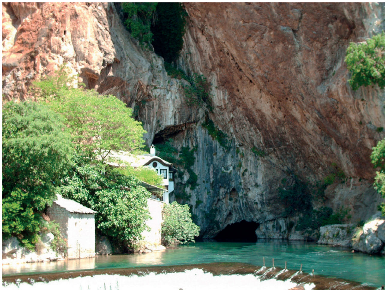
The Buna spring