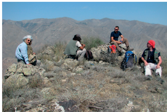
Geological mapping in East Azerbaijan Province, Iran.