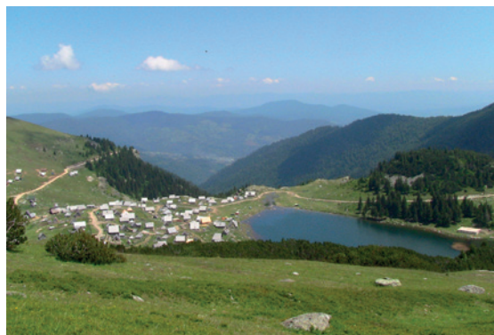
Prokoško Lake (Central Bosnia)