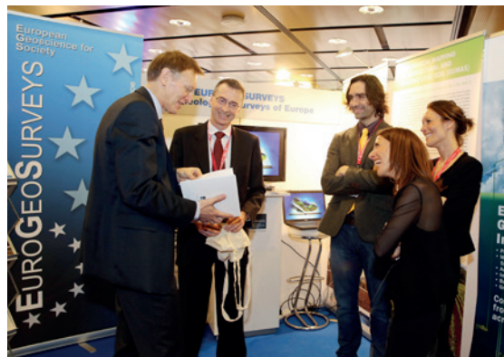
Mr Potočnik, European Commissioner for the Environment

During the Summit the importance of the in situ data had also been highlighted by the European Commissioner for the Environment, Janez Potočnik, who has suggested an increased focus on in situ data, big data and modeling; and a strengthened mechanism for resource commitments. Jacqueline McGlade, Senior Advisor, UNEP also stressed that GEO-X's focus on strengthening the link between in situ and satellite data is particularly crucial for UNEP's core mandate to keep the environment under review.